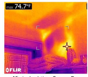
Missing Insulation – Summer Day E6 with MSX