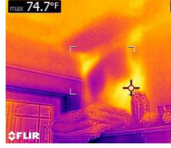
Missing Insulation – Summer Day E6 with MSX